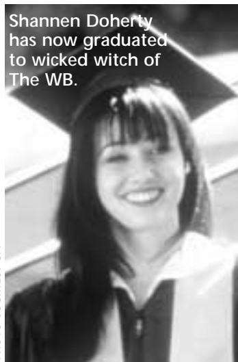
Shannen Doherty has now graduated to wicked witch of The WB.

Bad witch Shannen Doherty has been ousted from her role on The WB series Charmed allegedly because the wicked wench had problems with superfox Alyssa Milano. Given the choice, schlock-wizard Aaron Spelling decided to drop the house on the dysfunctional Doherty, confirming that Spelling Productions is definitely no place like home. This marks the second time that Spelling has banished Doherty — the two parted ways on Beverly Hills 90210 after cast and crew had to endure the slings and arrows from four years of outrageous temper tantrums. And her PMS problems haven't been limited