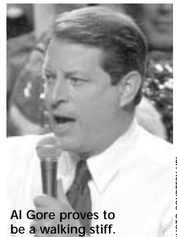
Al Gore proves to be a walking stiff.

"Hi, I'm Al Gore, and I used to be your next president of the United States," is how this looooooser should begin every community development class he plans to teach this fall at UCLA. He should also add, "Because I'm as stiff as a tree and couldn't even win my own state, I was chopped down by the U.S. Supreme Court. I now have plans to live my life in a Redwood forest where I can be among true constituents who appreciate me for who I am: An incompetent politician whose